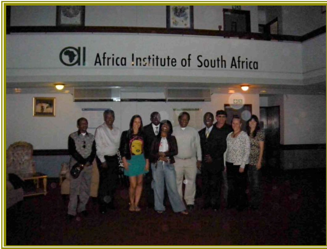
Attendees at the Meeting of ADF and AISA