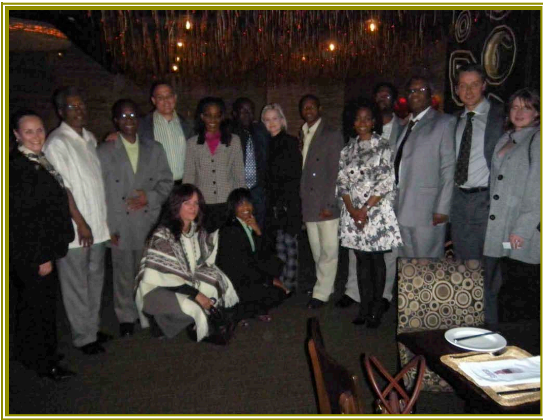
ADF Cocktail reception hosted at the Michelangelo Hotel in the Nelson Mandela Center in Sandton, Johannesburg

Africa Heritage - United States (AH-US) AHI House 325 Rivonia Boulevard PO Box 3343 Rivonia 2128 Gauteng South Africa +27 11 797 2000